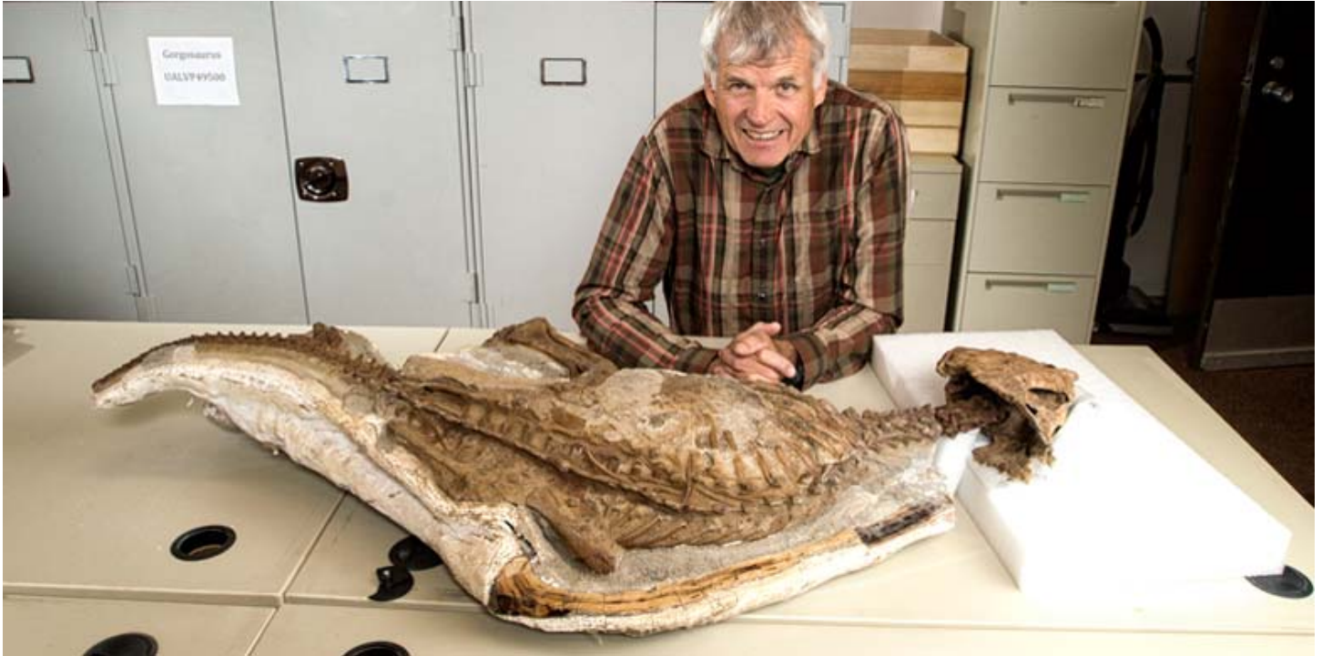
U of A paleontologist Philip Currie displays the pristine, near-complete skeleton of a baby Chasmosaurus, a relative of the Triceratops, he found in Alberta's badlands.

Philip Currie has made some spectacular and rare fossil finds while dino hunting in Alberta's badlands, so when he says a discovery ranks among the best of his career, it's significant.